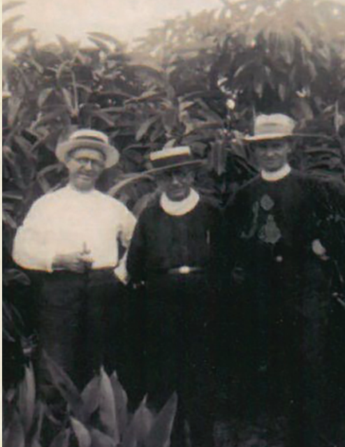
The early days of St. Anastasia