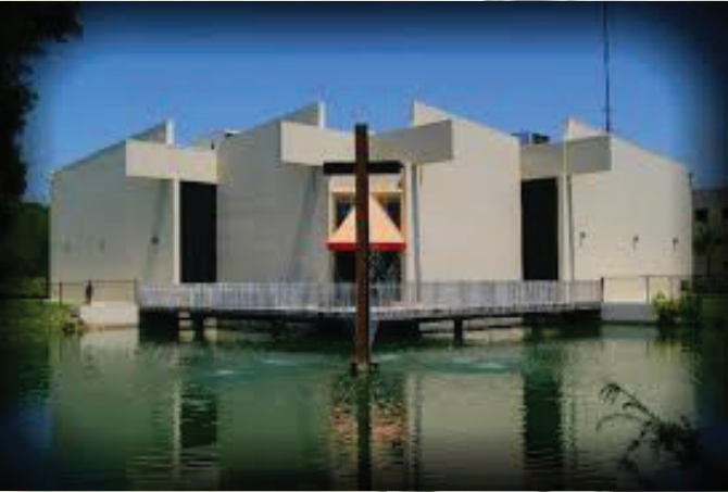
St. Anastasia Church on South 33rd Street.